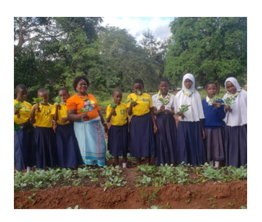
Kibasila Primary -Kisarawe