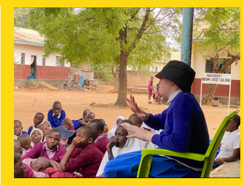
TGGA engaged 45 girls with disabilities at Buhangija Primary School in an Action on Body Confidence session to boost their self-esteem.

40,362 girls and young women from Arusha, Temeke, Kigamboni, Chalinze, and Morogoro completed their climate change badge training and currently are community initiatives leading on resilience. 173 climate girls from Kigamboni were trained in creating reusable sanitary towels and Menstrual Health Management (MHM), 65 young leaders from Dar es salaam learned about leadership and Sexual Reproductive Health and Rights (SRHR). Over 3000 girls in Shinyanga attained awareness on body confidence and selfesteem.