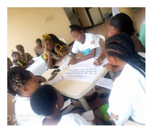
Young Leaders from Shinyanga