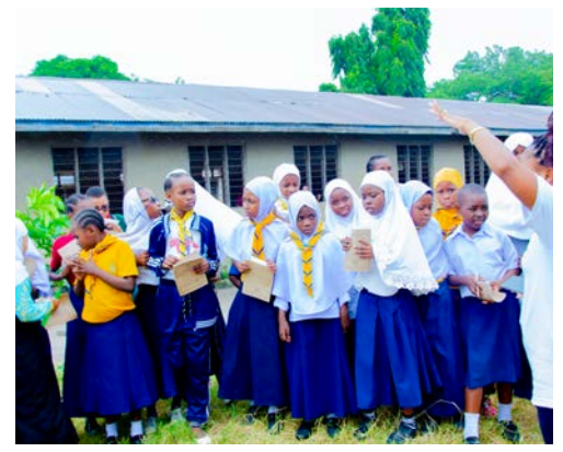
Girl guides from Temeke District