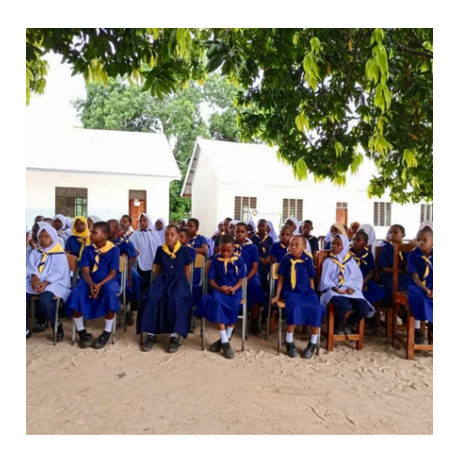
Girl Guides from -Tanga