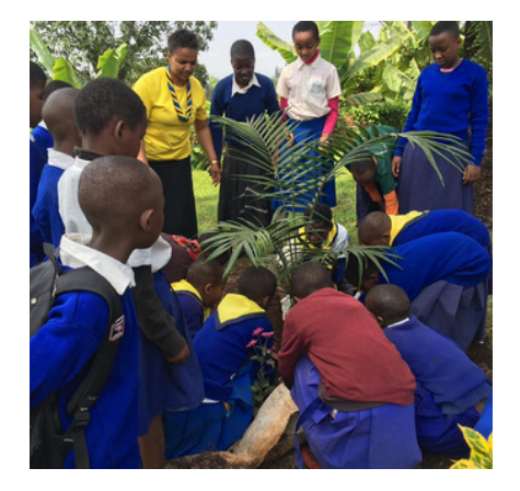
Girl Guides from - Kilimanjaro