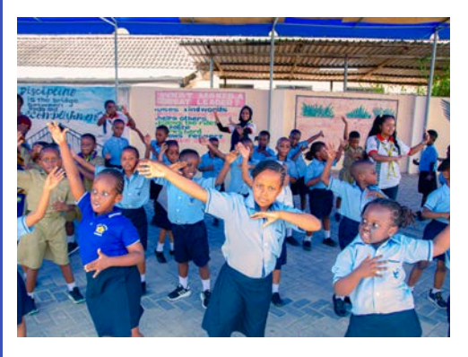
Milestone Academy P/S, Kinondoni