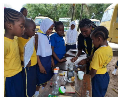
Nyamata P/S, Ilala District,